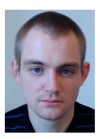
Figure 1. Example of the person perception task.

Person Perception Task. Using a half-block social relations design (Kenny et al. 2006; Snijders and Kenny 1999), every responder viewed every target (n = 30; see Figure 1) and rated each target on 16 traits. The traits included the 12 PCL:SV items in addition to attractiveness, intelligence, masculinity, and trustworthiness. The items attractiveness and masculinity were chosen because they give an indicator of the physical appearance of our targets. Trustworthiness was included because it can be seen as the opposite of psychopathy. We included the item intelligence because it has been shown in the literature that this item can be accurately perceived in strangers (Murphy et al. 2003; Zebrowitz et al. 2002; Reynolds and Gifford 2001). Faces were displayed until participants rated all characteristics and selected to move on to the next item. The order of targets was the same for each perceiver.