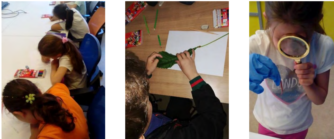
Figure 2. The activity processes