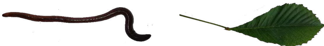
Figure 1. Entities observed in the activity

Prior to the activity, a focus group meeting was held to examine how the students perceived observation and how they performed it. After the interview was completed, a short break was taken to get the students' feedback and prepare the activity tools, and then the activity started. In the first step of the activity, students were given identical stationery materials, including crayons. They were asked to draw a worm and a leaf on the same paper separately based on their previous observations (past life experience). In the second step, sufficient time was given to the students to observe a leaf whose details are exact and a living worm in Figure 1. After observing, students were asked to draw the leaf and worm on the paper. In the third step, they were expected to observe the same beings through a magnifying glass. Students were expected to draw for the last time after using a tool, and they completed the activity.