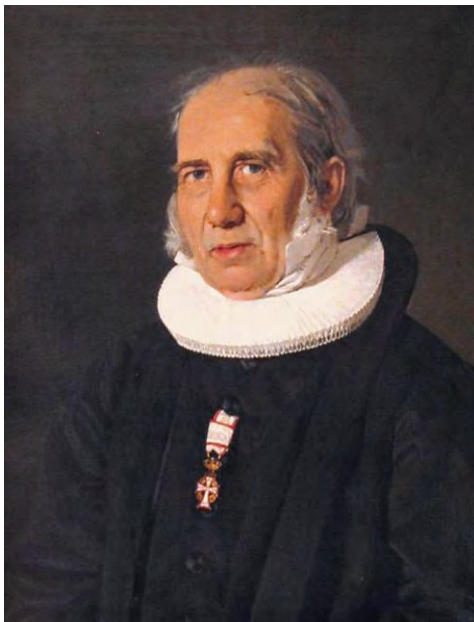
Fig. 1. Nikolaj Frederik Severin Grundtvig

In the middle of the 19th century, European pedagogy was dominated by two pedagogical trends, liberal and conservative one. A prominent figure in Denmark’s conservative pedagogy was a Danish priest, writer and philosopher Nikolaj Frederik Severin Grundtvig (1783–1872) (Figure 1).