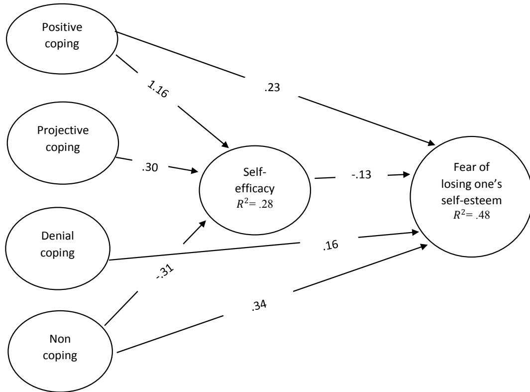
Figure 2. Path Model with Significant Paths