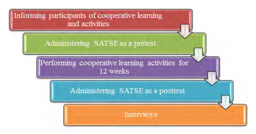
Figure 2. Research Process for the Experimental Group