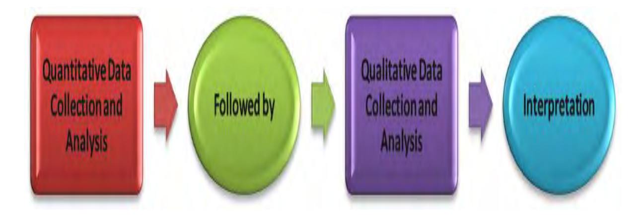
Figure 1. Explanatory Sequential Design

The explanatory sequential design was the mixed research design of choice in this study to ensure that participants understood the research questions. The explanatory sequential design consists of two stages: qualitative and quantitative (Creswell & Plano-Clark, 2015). In the first stage, quantitative data are collected, and statistical tests are used to overview the subject of interest. In the second stage, qualitative data are collected and analyzed based on quantitative results. The qualitative data helps the researcher explain and enrich the quantitative data (Creswell, 2009). Figure 1 shows the path diagram of the design.