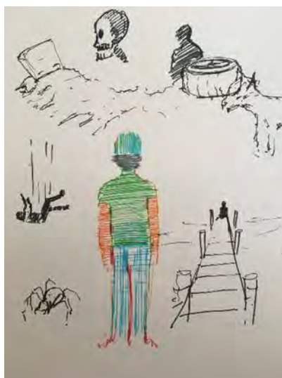
Figure 5. Repressed Emotions (Group 44, Kayseri)

Briefly stated, the teachers created artistic works by producing meanings in social, cultural, economic and psychological contexts. Such a practice in the workshop contributed to the teachers in terms of creating meaning from visual images, approaching them from different perspectives and looking critically.