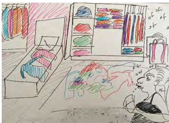
Figure 2. Nonsatisfaction (Group 11, Erzincan)

Some teachers commented the overall message underlying the image in the context of culture and society according to gender roles. In this respect, while they described men as strong, the one who can manage themselves, they described women as follows: weak, destined to be ruled, easily manipulated, whose purpose of coming into the world is to serve men and to reproduce. Some teachers' perceptions towards the images include the following statements: people of all colors and types can live together and accepting differences are natural. Thus, some groups questioned being sensitive to different cultures and created images using such concepts as respect for differences, empathy and tolerance in their artistic works. For example, Group 21 made an abstract transfer by using fingerprints of the group members in their artistic work 'Respect for Diversity.' They shared their views pertaining to the work; remarking that 'We made a picture that conveys the message of respecting for differences, not being prejudiced, welcoming people's different thoughts (good and bad) with tolerance, and accepting ourselves and others as what it is.'