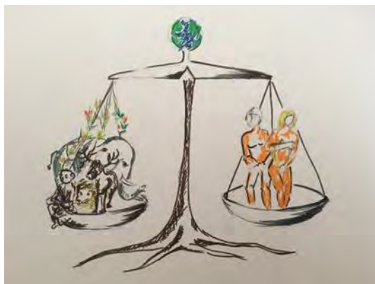
Figure 4. Natural Balance (Group 26, Denizli)

As a concept, it discusses natural balance. Animal rights are underlined through this concept. If we critically approach to image, we can articulate that people actually cause the extinction of animals and the deterioration of the natural balance by buying clothes made from animal fur and skin for their own pleasure.