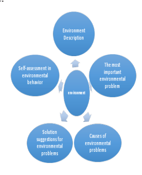
Figure 1: Candidate teachers' views on the environment and environmental problems

As seen in figure 1, the research findings aiming to determine the solution suggestions of the candidate science teachers to environmental problems were examined under five main themes: the definition of the environment, the most important environmental problem, the causes of environmental problems, solution suggestions and their behavior towards the environment.