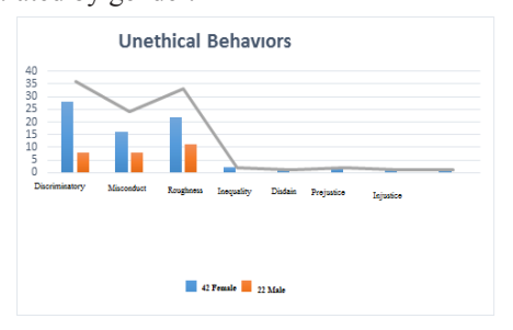
Figure 1: Unethical Behaviors

In the study, students were asked what unethical behaviors they encountered during their education life, and the answers were given in Figure 1, separated by gender.