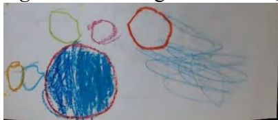
Figure 1. Drawing of the Earth, before the intervention

In one activity, the children were asked to draw the Earth. The drawing shown in Figure 1 was made by a girl prior to the intervention program. She drew a collection of circular shapes. The girl seems to have drawn from her imagination and not from any knowledge.