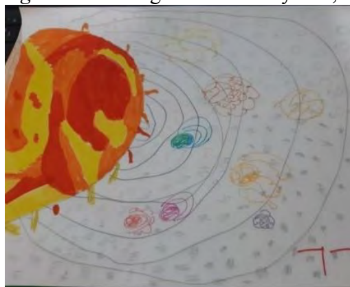
Figure 4. Drawing of the Solar System, after the Intervention

The children were asked to draw the Moon. In this drawing by a fifth child in the class (a boy) the Moon is painted as a yellow circle.