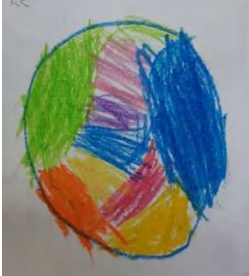
Figure 2. Drawing of the Earth, after the intervention

In another activity, the children were asked to draw the solar system. The drawing shown in Figure 3 was made by a second child (a boy), who drew the Sun in the center and larger than the other objects - the planets. He colored the Sun yellow, signifying light and heat. Each planet is painted in a different color and at a different distance from the Sun, which indicates that he understands there are multiple bodies in the solar system, and each one is a different distance from the central body. The Earth is colored blue and it is the third in the series. In the background, he drew stars as round, gray shapes. The child demonstrated a basic understanding of the structure of the solar system, in which the star of the Sun is the central body and at different distances from it there are planets, each of which has a characteristic size. In addition, the child demonstrated his knowledge that there are other stars in space.