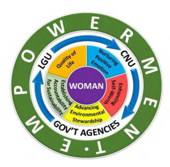
Fig. 2 A Tri-Focal Partnership Model on Empowering Women in the Community

From the extensive collection of both qualitative and quantitative data, the study yielded a considerable impact of the extension projects on the many facets of women empowerment which is the core of the extension project. By incorporating a sectoral - collaboration to implementation of the extension project and program, may result to nurturing positive emotions, enhancing self-worth, advancing environmental stewardship, establishing accountability for sustainability, and contributing to the quality of life of women as beneficiary of the project. Hence, the model, a tri-focal partnership model on empowering women in the community. The model illustrates the dynamic interplay of the roles and functions of the university which serves as the implementing institution and local government unit, and government agencies as partners in endeavoring a successful implementation of the extension project. Given the salient results of the current study, the model, if adopted in extension project for empowering women in the depressed communities may bring similar outcomes disclosed in this study.