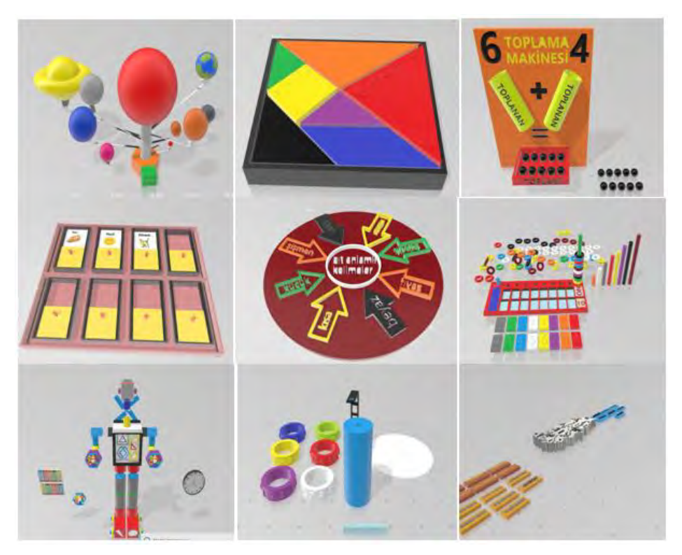
Figure 2. Learning object designs

7. Allowing participants to present their 3D learning objects as a group or individually every week.