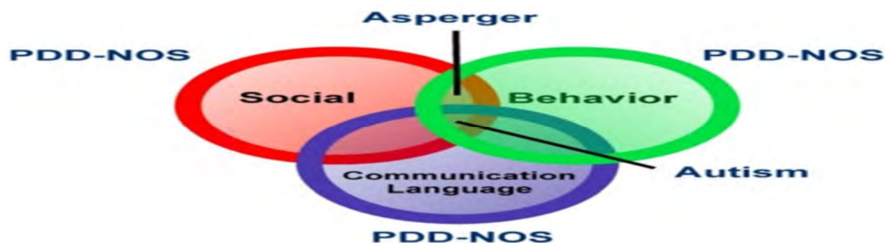
Figure 2. Types of autism.

in autism have been identified, including echolalia, pronoun reversal, metaphorical language, poor grammatical structure, atonality and arrhythmia. The followings are the main characteristics of language use and behaviors that are often found in children with ASD.