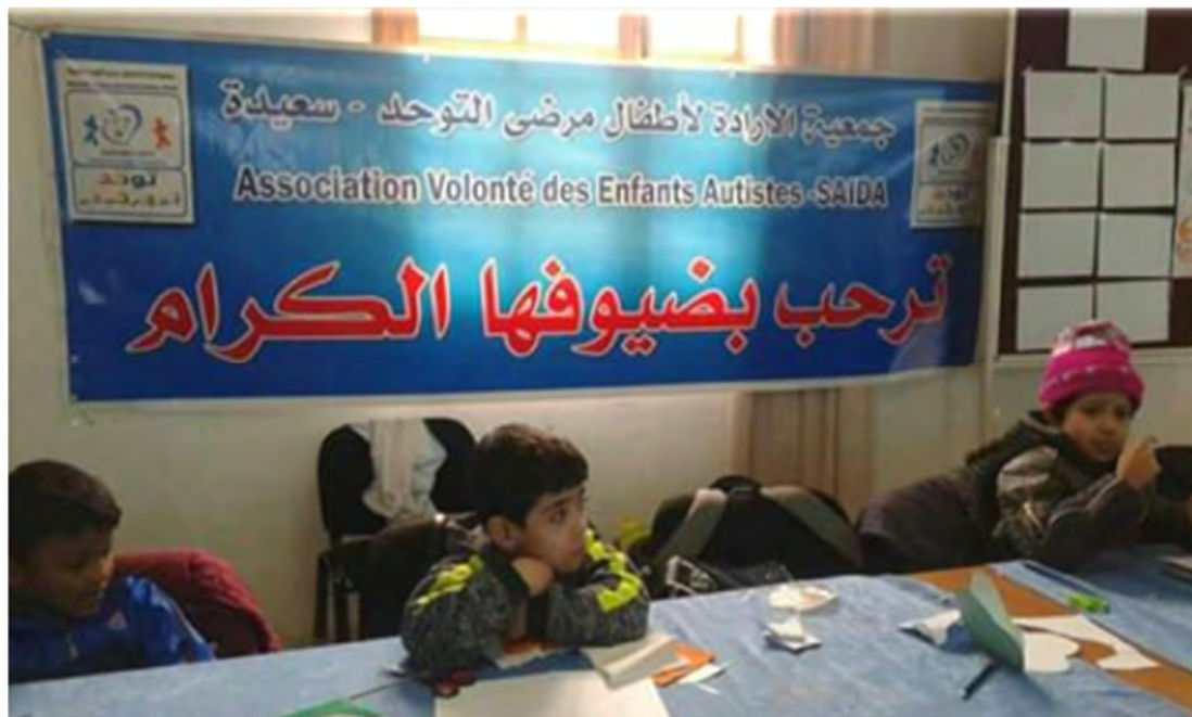
Figure 3. The Association of El Irada Litawaħud.

method to collect data because this method permits evaluators to study selected issues, cases, or events in-depth and detail; the fact that data collection is not constrained by pre-determined categories of analysis contributes to the depth and detail analysis of qualitative data. Additionally, a qualitative research method is widely used in healthcare research studies because it mainly targets the human experience they get, thus giving a better and deeper understanding of human morals which are complicated (Patton, 1987).