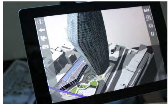
Figure 2 Augmented reality application used in architecture

It is possible to view the three-dimensional drawings of the structure planned to be built, created with CAD programs, by a device with an augmented reality application (Figure 2). Thus, the designer and the user can have the opportunity to gain experience about some details such as the front view of the building, the material to be