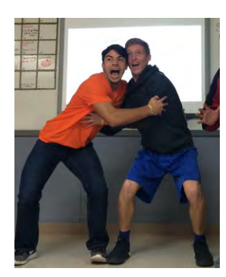
Figure 6. Tableau "shots" of creating the crash landing at the beginning of Lord of the Flies (Golding, 1954).