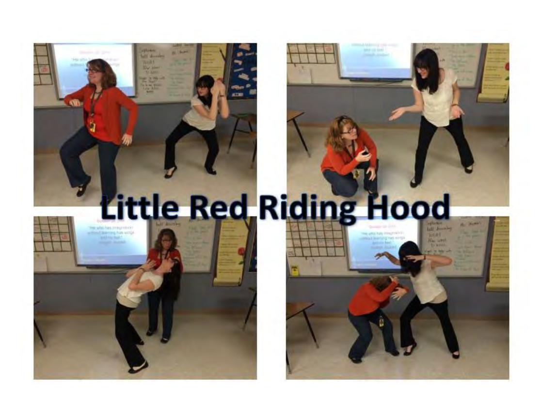
Figure 5. Tableau "shots" of the children's story Little Red Riding Hood.