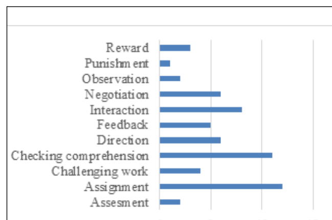
Fig. 2. Students' proposed activities in monitoring process

Eleven activities are proposed during the monitoring process in the classroom. Students suggest the following activities, from the most involved activities, namely having assignments, checking their understanding, having interaction, getting direction, getting feedback, getting a challenging work, knowing the reward, getting observation, having assessments, and knowing the punishment or the consequence of being involved or not during the learning process (see Figure 2). In