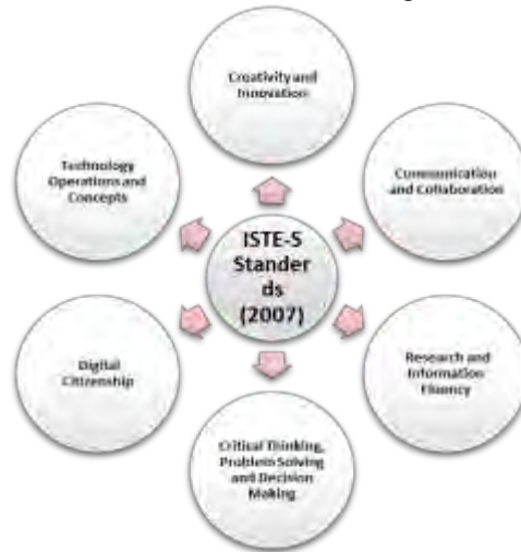
Figure 1 ISTE educational technology standards for students (ISTE-S, 2007)