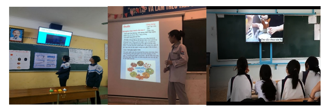
Figure 2. Illustrating images of students reporting project results.

The experimental process was conducted in three classes of grade 11 of three high schools (high school Yen Dung No. 2, Kon Tum High School, and Go Cong High School) in three north, central, and south regions of Vietnam in the school year 2019–2020 with three project group topics about alkanes, alcohols, and carboxylic acids (Figure 2).