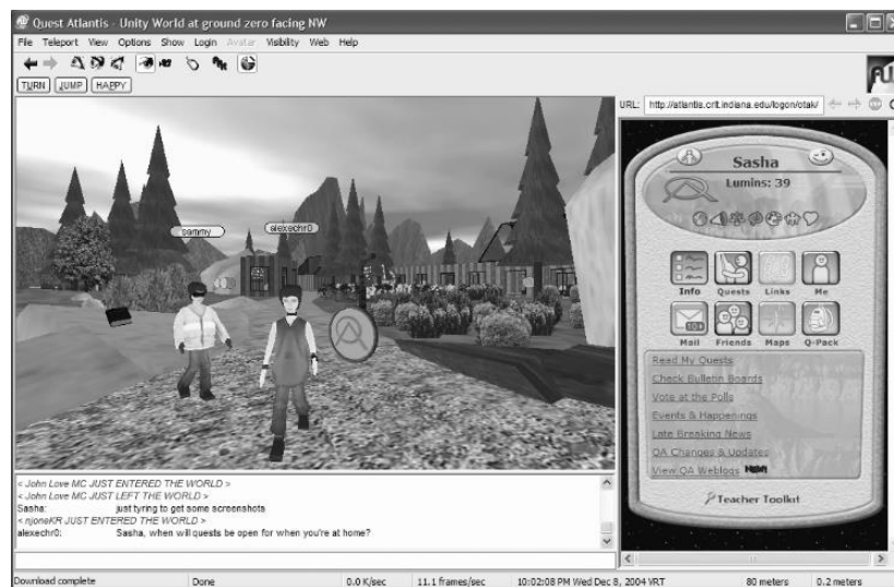
Figure 1. Screenshot of the virtual environment, showing the virtual environment on the left and the personal homepage of the player on the right.

Quest Atlantis is an educational computer game that immerses children ages 9-12 in a 3D, multi-user virtual environment for completing educational activities (see Figure 1). The purpose of the game is to save the mythical world of Atlantis from an impending disaster (Barab, Thomas, Dodge, Carteaux, & Tuzun, 2005). According to the back story of the game, as Questers (learners playing QA) complete educational activities called "Quests," they help save Atlantis from this disaster. Leveraging strategies from online role-playing games, QA combines strategies used in the commercial gaming environment with lessons from educational research on learning and motivation. It allows users to travel to virtual places to perform Quests, talk with other users and mentors, and build virtual personae. Quests are engaging curricular tasks designed to be entertaining yet educational.