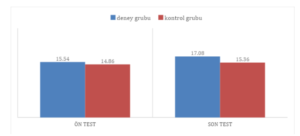
Figure 1: Experimental and control group academic achievement test pre-test and post-test chart Note. Experimental group, Control group

When the graph is examined, it can be seen that the academic achievement post-test scores of the experimental group students are higher than the pre-test scores, and the academic achievement post-test scores of the control group students are close to the pre-test scores.