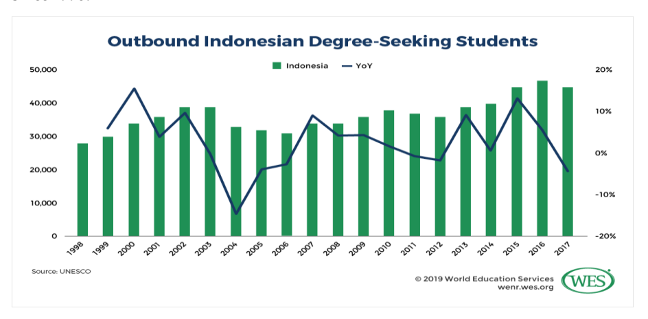
Figure 1: Indonesian Students Moving Abroad