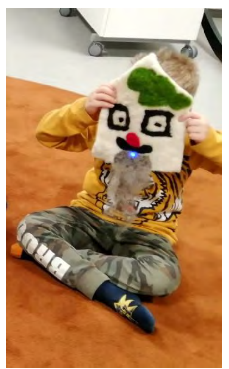
Figure 4. Power Creature with a soft circuit that was tested and sewn in

In the next phase, Grade 8 students (aged 13–14) helped the children sew the soft circuits into the creatures using conductive thread, a coin battery holder and an LED light. Together, they first checked whether the circuit designed by the pre-primary student worked, and then, they sewed both pieces of the creature together. The finished Power Creatures were visible evidence of the children's knowledge created through embodied and materially mediated means; through them, both the children and adults were able to see what was accomplished during the project (Figure 4). The children were happy with their creatures and played with them eagerly.