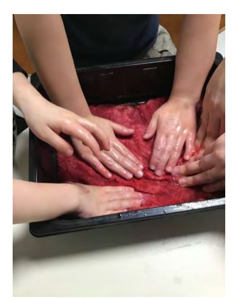
Figure 3. Collaborative felting

In the next phase, Grade 8 students (aged 13–14) helped the children sew the soft circuits into the creatures using conductive thread, a coin battery holder and an LED light. Together, they first checked whether the circuit designed by the pre-primary student worked, and then, they sewed both pieces of the creature together. The finished Power Creatures were visible evidence of the children's knowledge created through embodied and materially mediated means; through them, both the children and adults were able to see what was accomplished during the project (Figure 4). The children were happy with their creatures and played with them eagerly.