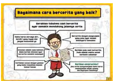
Figure 2. Design scrapbook of child stories