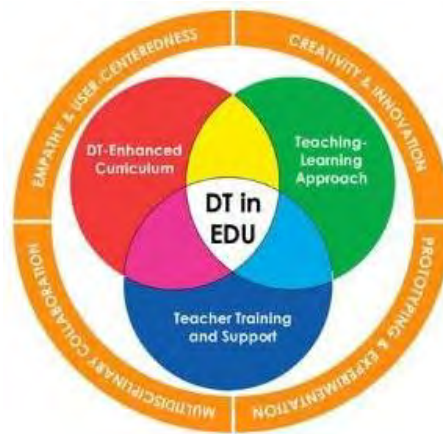
Figure 2. DT application framework in education field sources [29]

Brown [31] indicates that design thinking is a concept that involves the imagination, vision, and strategies of a creator. This meets the concerns of end-users to establish a technologically feasible and successful solution. In addition, Serrat [32] also states why concept analysis is a non-linear technique to look at to give insights into the mechanism to cope with unforeseen issues. Such questions are what most product theorists found as false problems or problems, which remain unsolved or can only be overcome through solutions via multidisciplinary approaches.