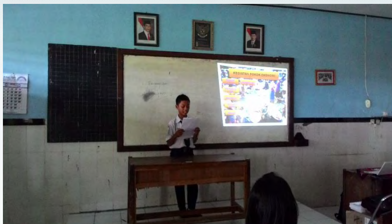
Figure 5. Students presenting the results of the discussion

Review and evaluation. In the review and evaluation phase, the role of teacher is to conclude the groups presentations. The teacher evaluates the presentations and conducts a final evaluation to determine the extent of the student's level of understanding.