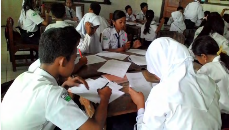
Figure 3. Students are analyzing problems in the EBL learning model

in accessing the necessary information and resources. This stage shown in figure 3 below.