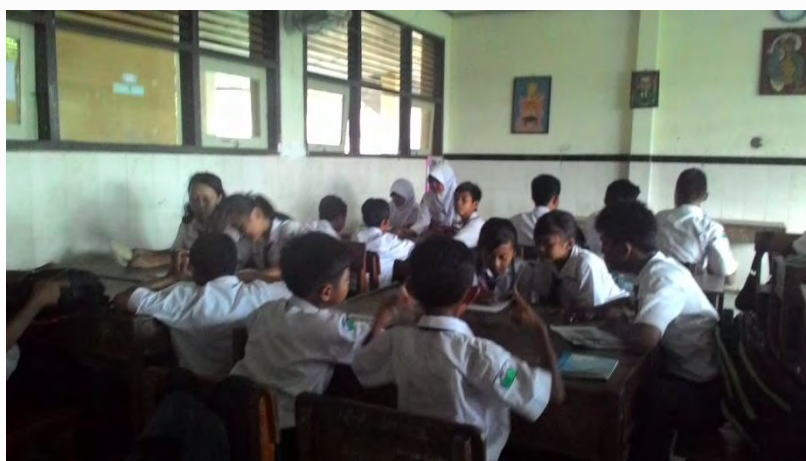
Figure 2. Students are implementing a case study in the EBL learning model

Facing problem. The role of the teacher in this phase is to present a problem, which includes (1) Presentation of problems related to the social environment; (2) facilitating student discussion of the problem; (3) explaining the learning objectives; and (4) motivating students to be actively involved. This stage shown in figure 2.