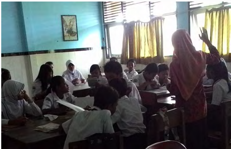
Figure 4. Students are finding and reporting the discussed problems

Discovering and Reporting. In the discovering and reporting phase, the teacher encourages students to obtain appropriate information. Students seek information from libraries, books and other sources. Students carry out discussion activities and exchange ideas within their group and work towards a consensus solution. Figure 4 below shows the stage.