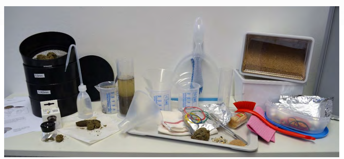
Figure 1. Contents of the GeoBox