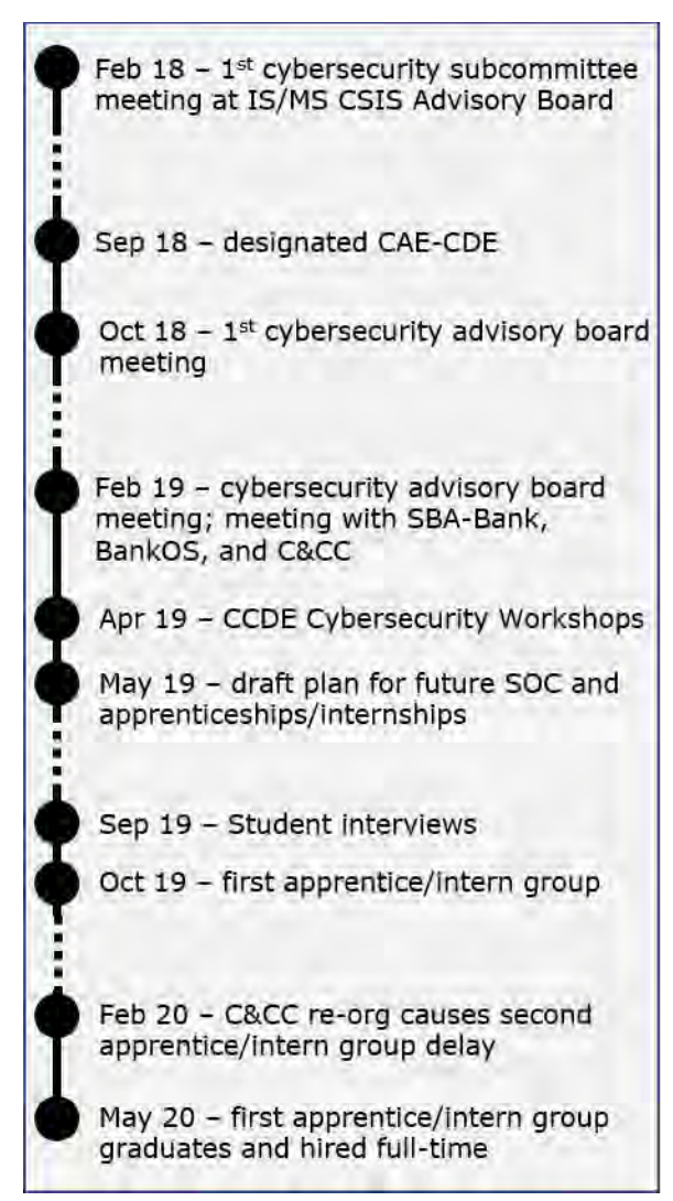
Figure 3 - C&CC Apprenticeship key event timeline

Step two was a meeting in late May 2019 where the CISO convened a meeting at SBA-Bank with