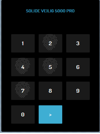
Figure 5 - CyberStart Go medium challenge

The game, called CyberStart Go, features 12 introductory problem-solving challenges (5 easy, 6 medium, 1 hard) related to subjects like cryptography, forensics, and Linux. For example, one of the medium challenges categorized under cryptography displayed the electronic keypad in Figure 5 and asked players to help determine the four-digit PIN using the fingerprints as a clue. Readers curious about the game can peruse it here: https://go.joincyberstart.com/.