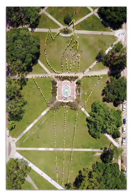
Figure 5: "Torch the Green"—students forming a torch on Landis Green during spring 2017

their 3D-printed torches twelve miles into space during spring 2016 and arranging hundreds of students in a giant torch centered on FSU's president on Landis Green in spring 2017. Figures 4 and 5 show the students' successful completion of their overarching goals for each semester.