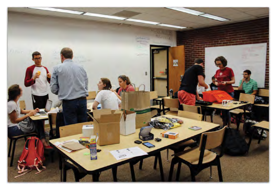
Figure 2: Students in the FSU Collaboratory working on payload design in spring 2016

The "Design" phase lasted three weeks in spring 2016 and four weeks in spring 2017. During this phase, the students worked in teams (organized according to the topics covered during the Explore phase) to brainstorm possible solutions to the semester's overarching goal; Figure 2