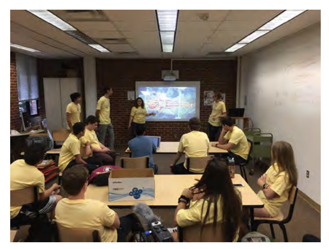
Figure 3: Students in the FSU Collaboratory preparing to deploy their plans in spring 2017

The Deploy phase lasted three weeks both semesters. During this phase, the students came together to test their designs, assemble prototypes, and prepare for the day when they would put their ideas into action; Figure 3 shows students preparing to create a human torch on the green in spring 2017. This phase featured many last-minute design changes as the students tested their ideas in and out of class (documented in the teams' second group progress reports). The "launch the torch" design, for example, underwent radical revisions in spring 2016 when the students decided to streamline the payload mass to under one kilogram, while the students' plans to "torch the green" in spring 2017 were literally turned upside down when they realized they would get better images if they rotated their design 180 degrees. This phase culminated with the actual event, and in each case the students succeeded magnificently, sending