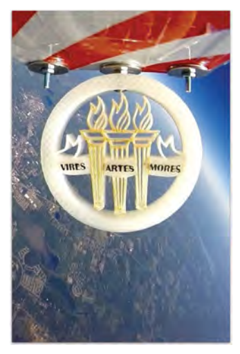
Figure 4: "Launch the Torch"—FSU torches sent 12 miles into space during spring 2016