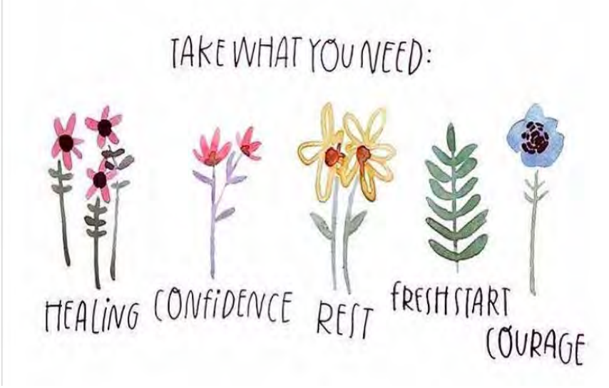
Figure 5. Inspirational words posted on the Canvas announcement page at the end of the week.