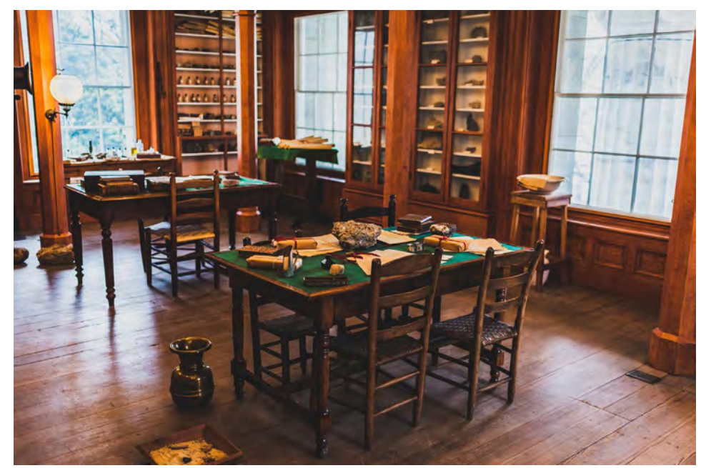
Figure 2. Virtual background on my Zoom screen to set the stage for our virtual breakfast session.

As they were having breakfast, the students took turns speaking. I posted prompts for the check-in activity on Friday of the previous week to give my students ample time to read and think (see the agenda in Figure 3). In all the check-in sessions, I got them to talk about how they felt before they responded to the other questions. I did this to encourage student engagement so that there was a sense of social presence to sustain learning.