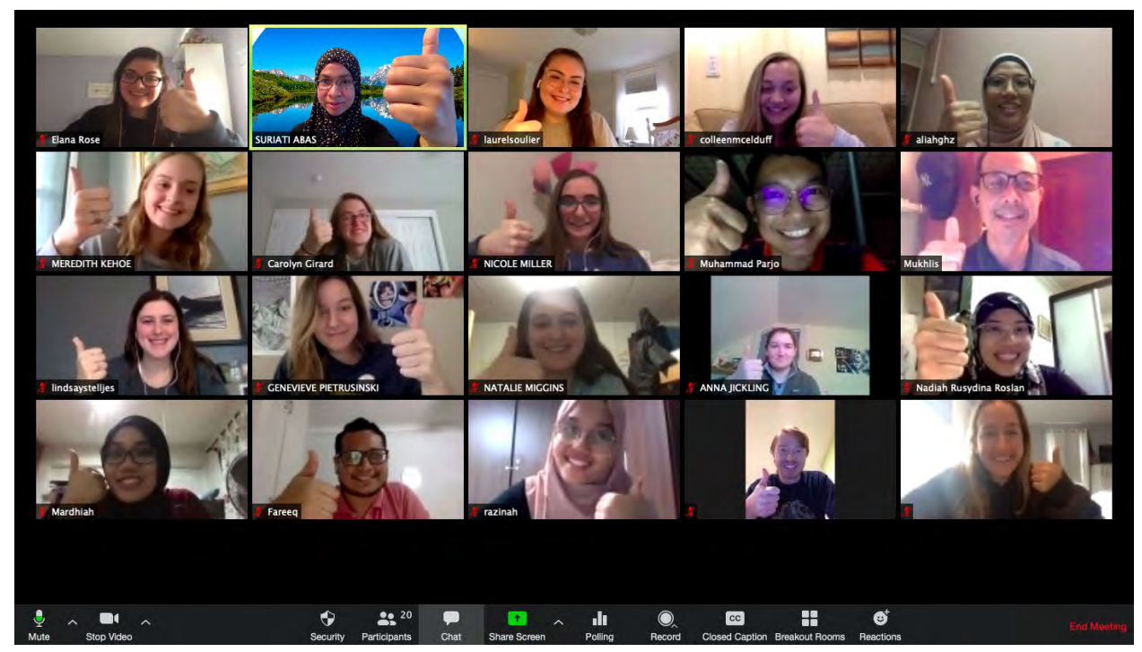
Figure 6. Preservice teachers from the United States and Singapore. Screenshot courtesy of the author. Reproduced with permission of the participants.