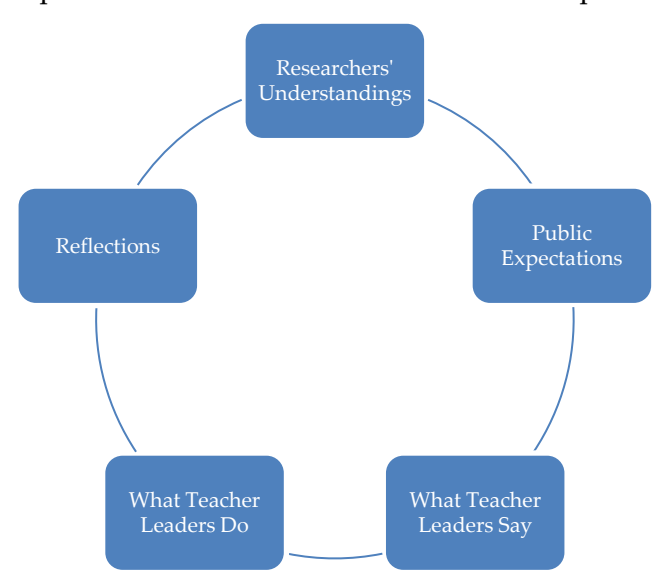
Figure 2. Study Components

The study components also are intended to investigate the coherence of, (a) educational organizations' public expectations for teacher leaders, (b) educators' personal understandings of teacher leadership, (c) contextualized manifestations of teacher leadership, and (d) retrospective accounts of how teacher leadership is lived.