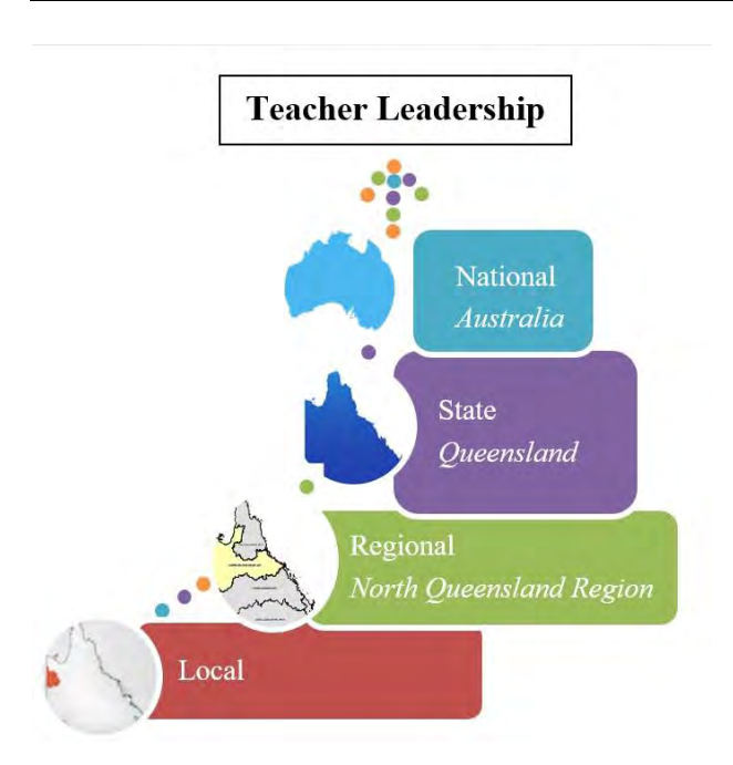
Figure 1. The Four Administrative Levels

First considered is the national level, then Queensland as one of the states of Australia, followed by the regional level of North Queensland as one of seven educational regions in the state, and finally, one local state primary school within that region of North Queensland.