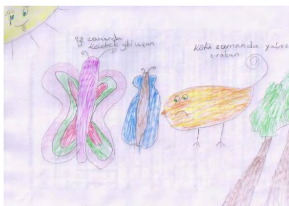
Figure 1. K82KS11

Some examples of drawings that belong to Syrian children: