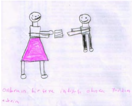
Figure 5. K42KT12

Some examples of drawings belonged to Turkish children: