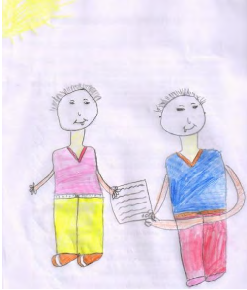
Figure 3. K76KS11