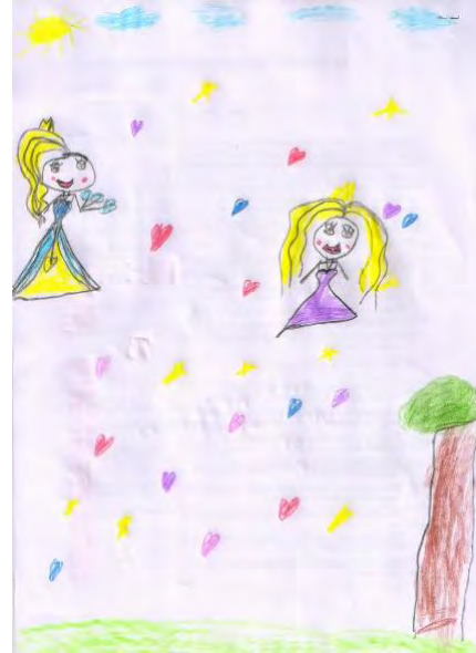
Figure 4. K86KS9

Figure 1 shows a drawing of an 11-year-old Syrian girl who described her Turkish friend as “flying like a butterfly in good times and abandoning me in bad times”. In Figure 2, there is a heart above the Turkish flag and a sentence says, “I love my Turkish friend so much”. In Figure 3, we can see a child sharing his book/notebook with his friend. In Figure 4, a girl described her love to her friend drawing a lot of hearts as a sign of her love.