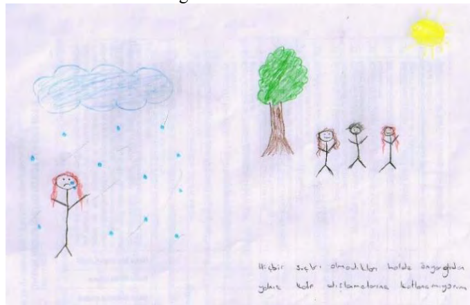
Figure 8. K31KT17