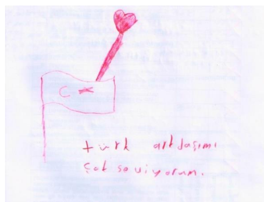
Figure 2. K96ES11