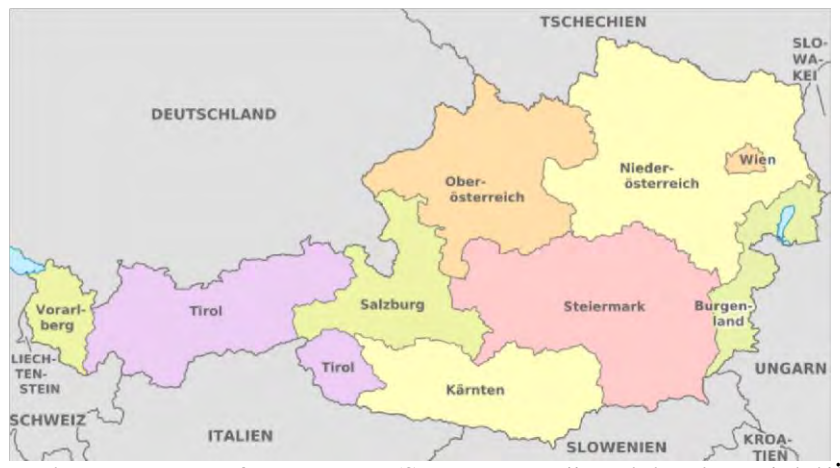
Figure 1. Austria: Borders and federal states

Austria is a middle-European country which borders on eight other countries: to the north are Germany and the Czech Republic; to the east are Hungary and Slovakia; to the south are Italy and Slovenia; to the west are Switzerland and Lichtenstein. Austria is a parliamentary federal republic with German as its official language. Slovenian is also an officially recognized language in the federal state of Carinthia as is Burgenland-Croatian in the federal state of Burgenland. The chancellor-led federal government exerts influence over all law-making matters. Certainly, however, the nine federal states of Burgenland, Carinthia, Lower Austria, Salzburg, Styria, Tyrol, Upper Austria, Vorarlberg, and the Austrian federal capital Vienna also exercise law-making functions and in certain areas have administrative primacy.