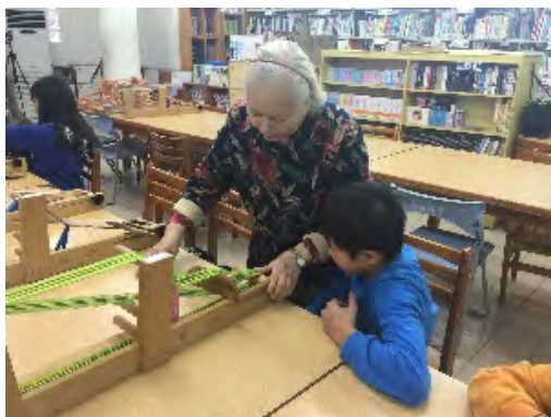
Figure 1. Local Atayal artisan teaching the class