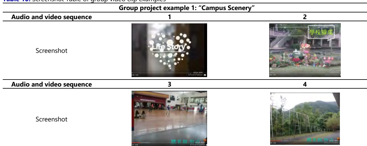
Table 10. Screenshot Table of group video clip examples

(B) Products of the information technology classes: The semester’s classes are centered on “Atayal culture”. The Nan’ao campus was the subject of the first lessons, and when students became more familiar with how to film videos and write scripts, they moved on to filming interview videos of people and cultural crafts lessons (see Table 10 ). The research team used the VivaVideo app to guide groups of students through video filming, post-editing, and final presentations.