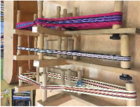
Figure 3. Traditional Atayal woven belt