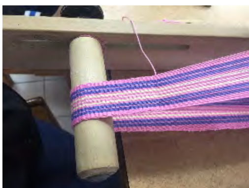
Figure 2. Traditional Atayal weaving

lives and learning environments that lead to low learning motivation; however, the students are extremely interested in hands-on teaching activities and their learning characteristics are consistent with those demonstrated in the literature.