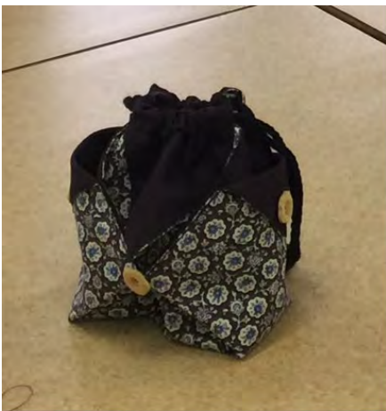
Figure 4. Completed traditional cloth bag

"I like the sewing classes the most. The bags we made are simple and practical. I'm really happy with what I made. (S06-20160418)"