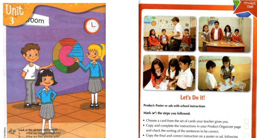
Figure 2. Examples of illustrations and photos in Textbook 2

children and adult human-like characters as well as some anthropomorphic animals which were not considered for analysis given these types of illustrations do not appear across all three books. There are no leading characters in the illustrations, although some characters reappear in some units.