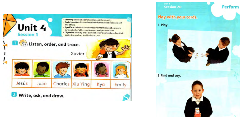
Figure 3. Examples of illustrations and photos in Textbook 3

In Textbook 3, the photos are used to present the finished products and in some lesson activities, whereas illustrations are only used in lesson activities. This book has a self-evaluation section with no images in a review section. The characters in the photos are limited and appear in all the units while characters in the illustrations include children and adult human-like characters. As in the other books, there are no main characters appearing throughout the book, but some appear more than once in some units.