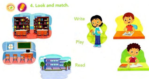
Figure 1: Examples of illustrations and photos in Textbook 1

Images are used in a slightly different manner in each book. In Textbook 1, the photos are used to present the units and to display the process of task products while illustrations are used for lesson activities and evaluations. In the photos, there is a limited number of characters who appear throughout the book. The illustrations in this textbook include both children and adult human-like characters. There are no leading characters appearing in every unit. However, some characters are recurring in some units.