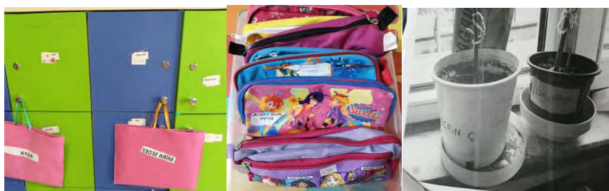
Figure 3. Images of the written form of children in some kindergartens

“Yes, he writes names both in the materials and in the cabinets of children.” (T29-T44)