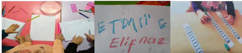
Figure 5. Photos taken while writing the names of children in some kindergarten

In Figure 5, photographs of the children were taken while writing their names.