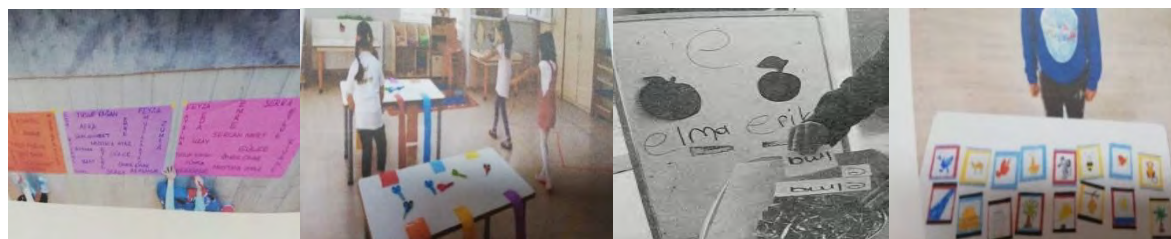
Figure 6. Photos of some teachers' works

“We work on phoneme training, drawing activities, phonological awareness.” (T26)