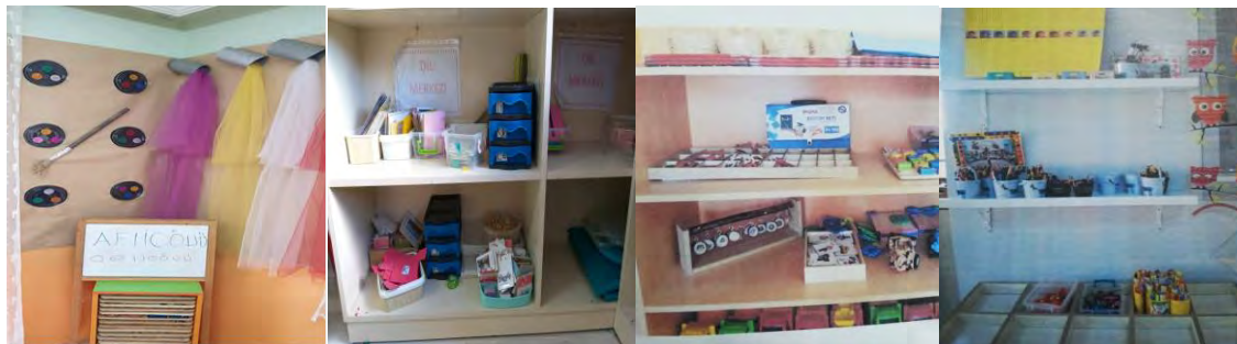
Figure 1. Images of readiness for reading and writing center in some kindergartens

"We have a center with letters and cards called the language center."(T 21)