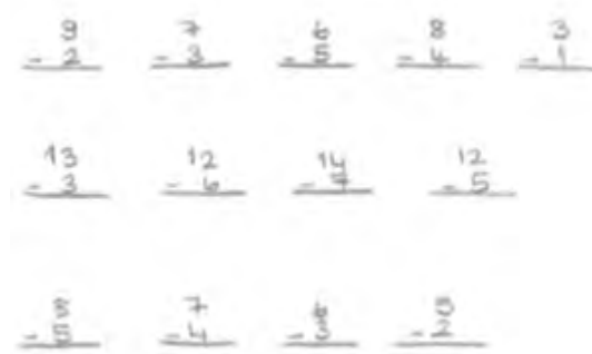
Figure 7. The student's level of subtraction skill after the practice