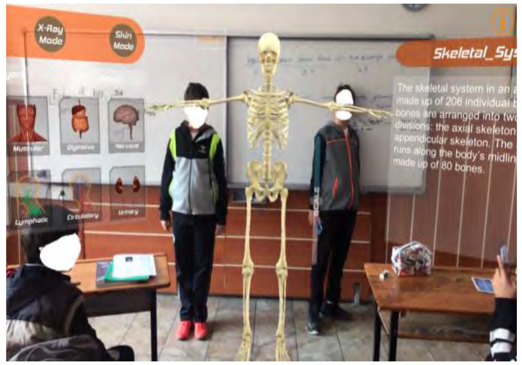
Figure 3. Skeleton System