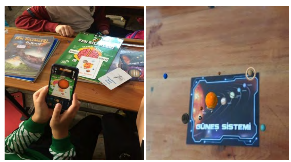
Figure 1. Solar System