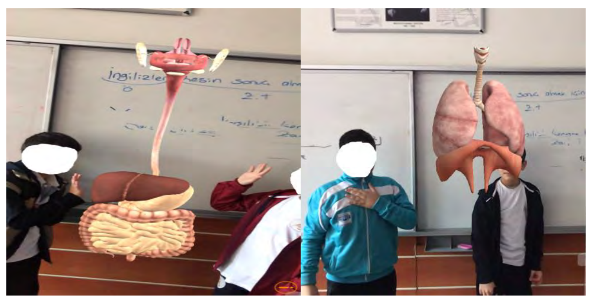
Figure 4. Digestion System