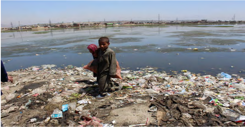
Figure 4: refuse dumping site within the human settlement in Kabul with a boy dumping refuse and scavenging animals.