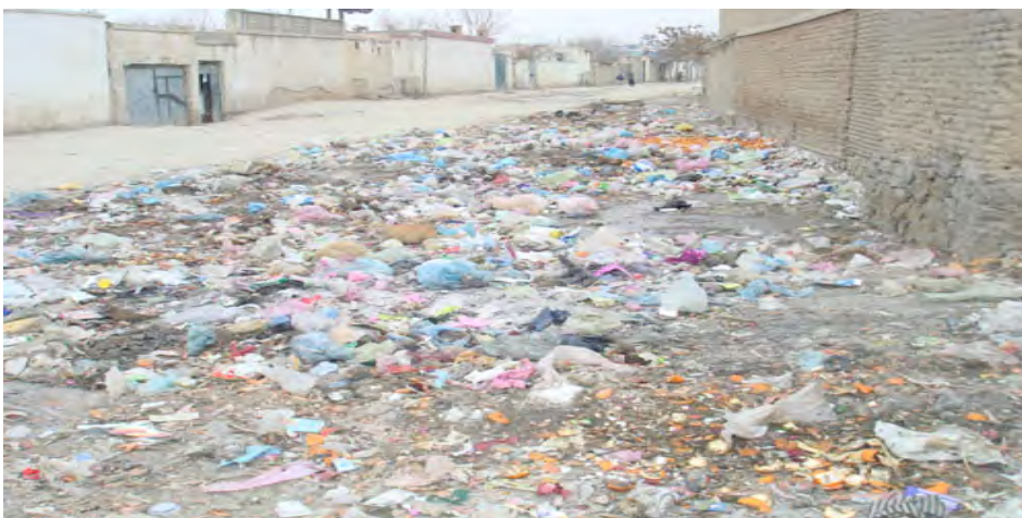
Figure 3: refuse dumping site within a residential location in Kabul with a human waste scavenger and explore.