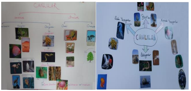
Figure 3 Examples of PSTs' first semantic networks