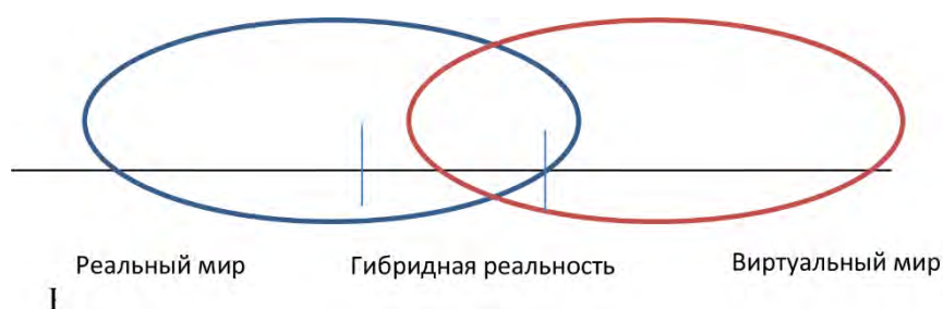
Figure 1. Combination of worlds (the author's point of view)

However, each medal has two sides. And if we talk about the minuses of the hybrid reality, it is necessary to delve into the essence of this issue and understand how the process works from the inside (see Fig. 1).