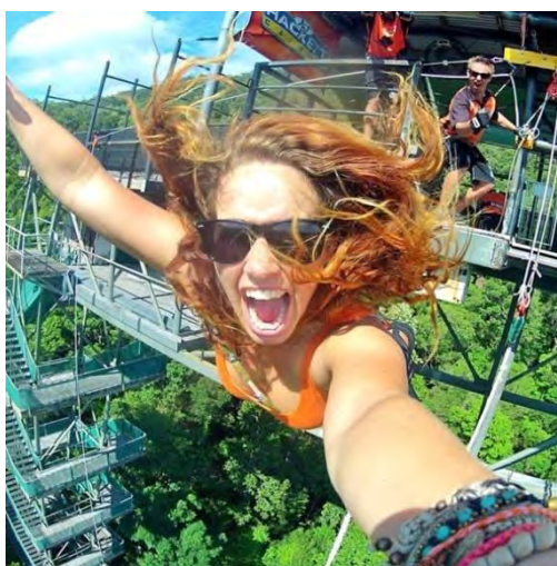
Figure 3. Crazy and original selfies ( http://batona.net )

Social networks have simplified this process greatly. SMM users compete in resourcefulness, courage, and insanity while creating self-shots (see Figure 3). Self-shot a snapshot of yourself (using a smartphone / a mobile phone) and then this snapshot is posted in social networks ( https://www.drive2.ru ).