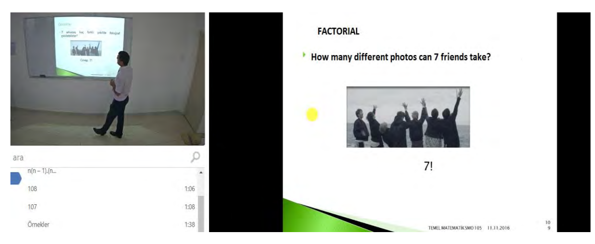
Figure 3. Teaching of subjects with multimedia content (such as images, texts and audio).