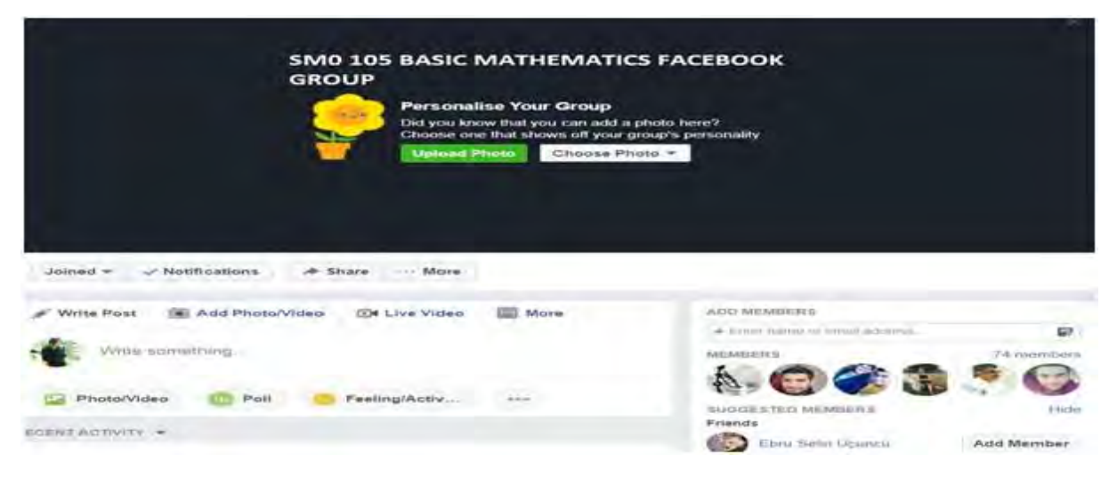
Figure 2. SMO 105 Code Basic Mathematics Facebook Group.