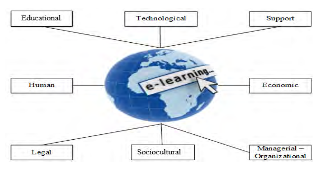
Figure 3. Challenges of the Iranian e-learning system.

These eight dimensions of setbacks and problems are discussed next.