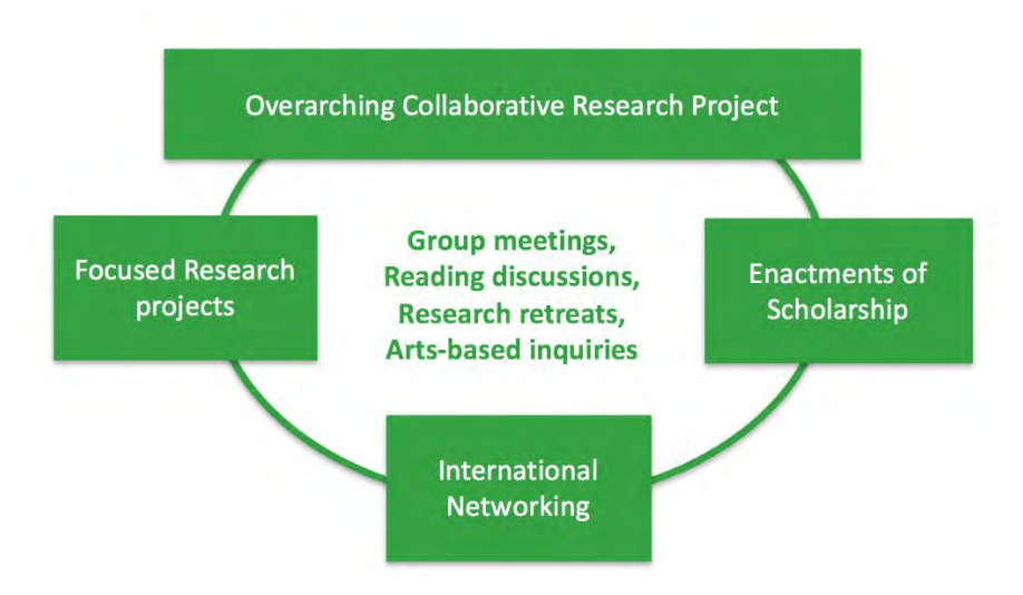
Figure 2: The Collaborative Reflective Experience and Practice in Education (CREPE) Faculty Research Group research model

The collaboration model (Figure 2) became the strength of our collaborative research. By living these elements and processes, we generated not only a stronger community, but affirmed our conceptual and methodological knowledge, skills, and dispositions. We have come to understand the nature of collaboration and live the benefits of this close collegial research through meta-reflective processes, framed theoretically and methodologically.