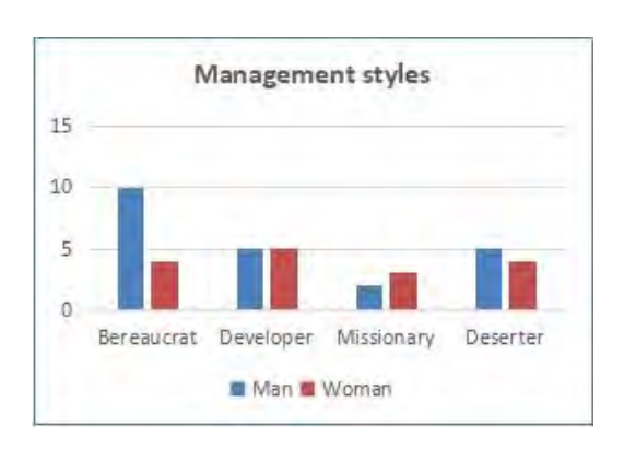
Figure 2. Management styles

One of the functions of the leaders is to carry out the management process in the organization. Leaders who are willing to follow the appropriate strategy will accelerate strategic activities [29]. The assessment results of the Management Style Diagnostic Test show the management style shown in Figure 2.