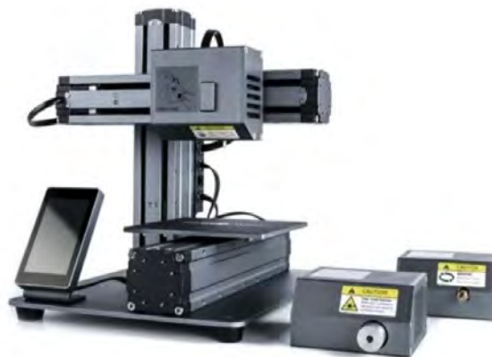
Figure 1. 3D printer model snapmaker 3-in-1

Throughout the project, students use various software to complete their projects. Students used AutoCAD software from Autodesk to design the mechanical parts by drawing several multiview and isometric drawings in 2D and 3D forms. Meanwhile, students also utilized OrCAD software from Cadence to design the electrical and electronic circuits. After that, each group converted the circuitry into the printed circuit board layout to obtain the electrical part dimensions. Then, an assembly drawing combines both mechanical and electrical parts, similar to the manual of electrical and electronic products. Finally, each group printed some mechanical parts from their project using a 3D printer, model Snapmaker 3-in-1, as shown in Figure 1, using SnapmakerJS software.