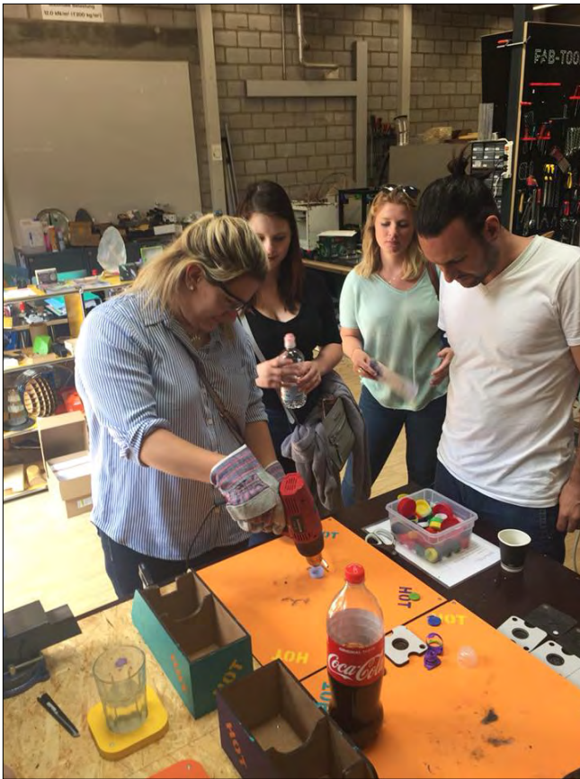
FIGURE 6. Study abroad students at the FabLab Luzern makerspace, using a tool to melt a plastic bottle cap to make a shirt button.