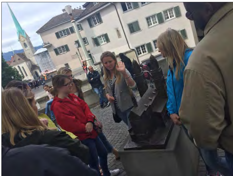
FIGURE 5. Study abroad students listening to a tour guide share information about the city of Zurich.

teaching and learning in a range of educational settings. One of these activities was the visit to The Lucerne School of Art and Design, which is the oldest college of art and design in German-speaking Switzerland. During the visit, the group interacted with some of the research groups. Of particular interest was a meeting with the “visual narrative” research group. This research group explores narrative, staging, and interpretation in linear and non-linear media, investigates the use and reception of these media, and designs new communication strategies and formats in visual media.