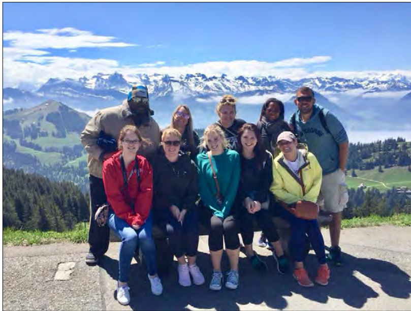
FIGURE 4. The University of Tampa “Teaching and Learning Innovation in Switzerland” study abroad students and instructors at Mount Rigi.