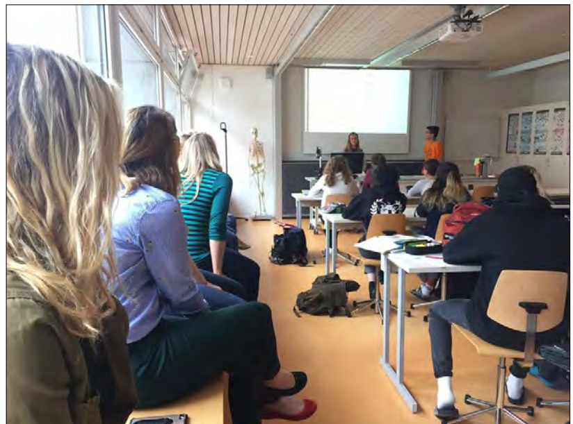
FIGURE 8. Study abroad students in a high school classroom, observing a presentation by students from the Kantonsschule Schüpfheim/Gymnasium Plus

"The semester after this program I entered my senior year completing my undergrad in elementary education. This program provided me with a different perspective on classrooms and educational systems of different countries. The program helped me to develop skills in my teaching practices that my peers had not been exposed to."