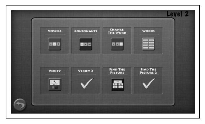
Figure 2. Screenshot of a sample task selection menu (shown in gray scale).