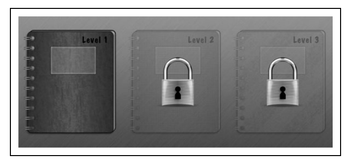
Figure 3. Screenshot of the levels with locked content in Levels 2 and 3 (shown in gray scale).

larger study determining the assessment's technical adequacy. Werbach and Hunter (2012) consider it a developer's purview to determine how levels , or the components that show a player's position in the game, will be defined. In the experimental study, the levels were paired with content unlocking, which serves as another form of challenge, feedback, and reward (Werbach & Hunter, 2012). Students had to complete all tasks in a given level to unlock the next level.