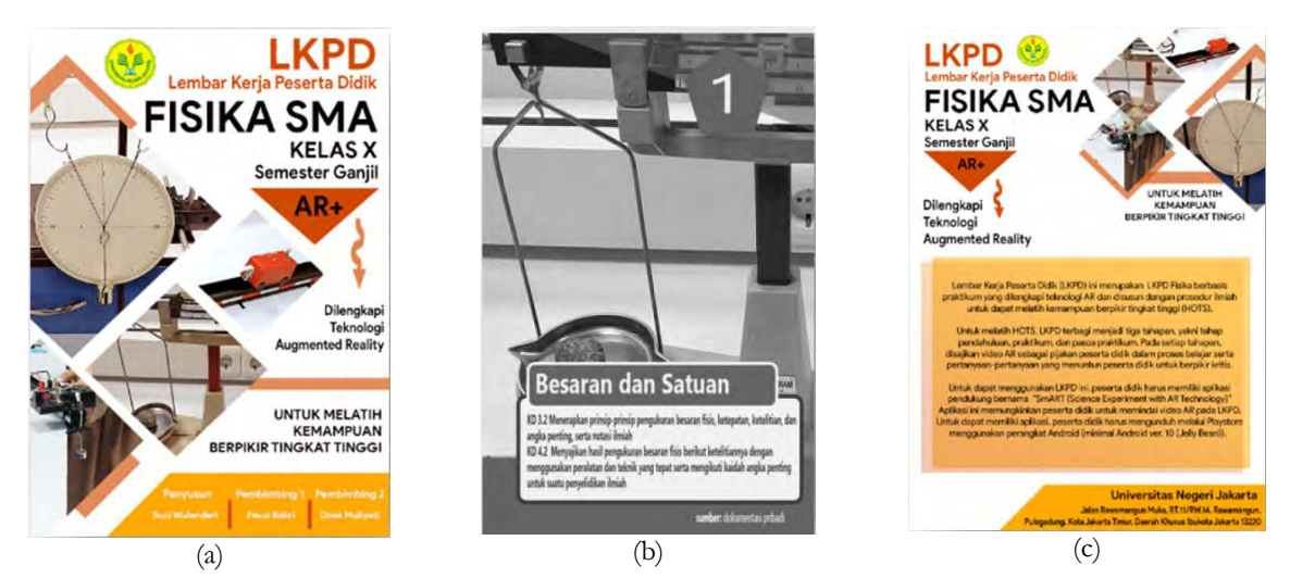
Figure 1. The cover view (a) front cover, (b) inside cover, (c) back cover of the student worksheet