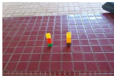
b) Photographing cubes (4 and 4 made 8) -by Rozy