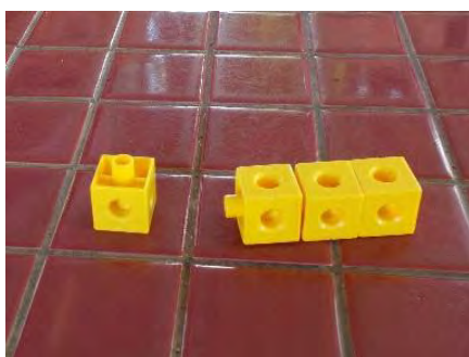
a) 3 (in a line) and 1 by Qaisya