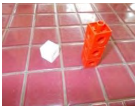
c) 3 (in a pile) and 1 by Aimy