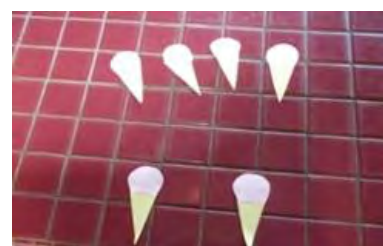
d) Photographing (4 and 2 made 6) – by Aimy