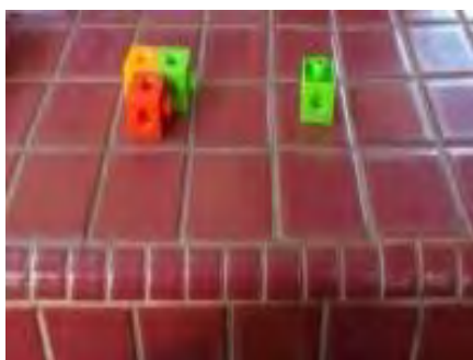
b) 3 (in a group) and 1 by Rozy