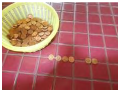
a) Photographing coins (4 and 2 made 6) – by Norman