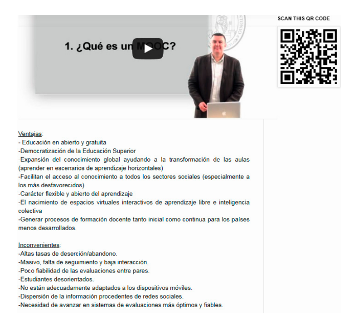
Figure 1. Edublog of a student in which she makes a metacognitive and reflexive analysis of the positive and negative aspects of the MOOC courses.

In Figure 1, an edublog made by a student of this subject is presented as an example: